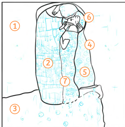
Klimt - 'The Kiss**